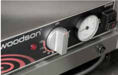
Now with more control of the cooking process