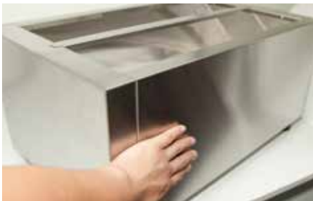
Cool-to-touch safety feature during operation